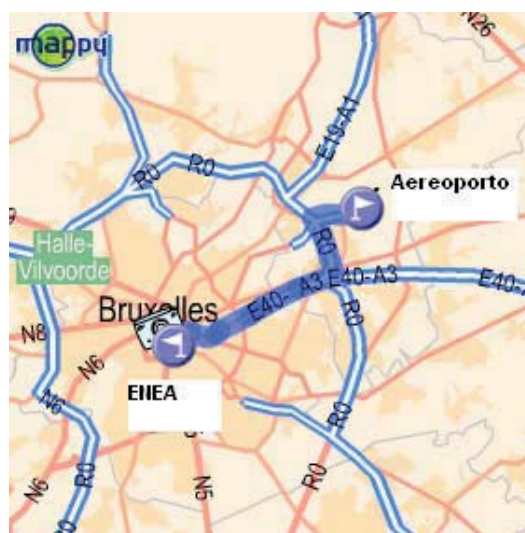
Map from Zaventem Airport